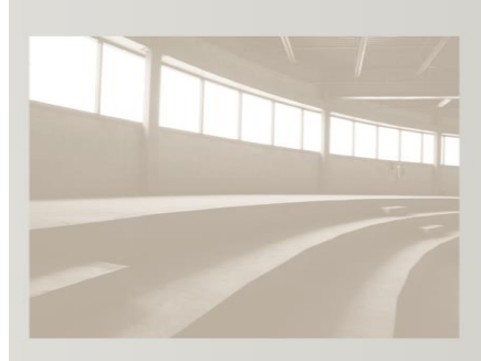
Thank you for your support.