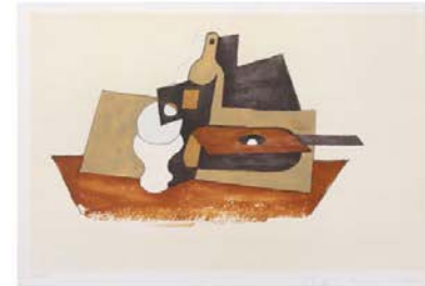
PABLO PICASSO GUITARE VERRE ET BOUTEILLE