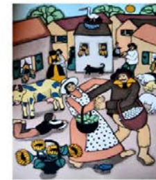
ELKE SOMMER VILLAGE SCENE-LOVERS