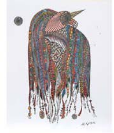
OVADIA ALKARA FEATHERED BIRD