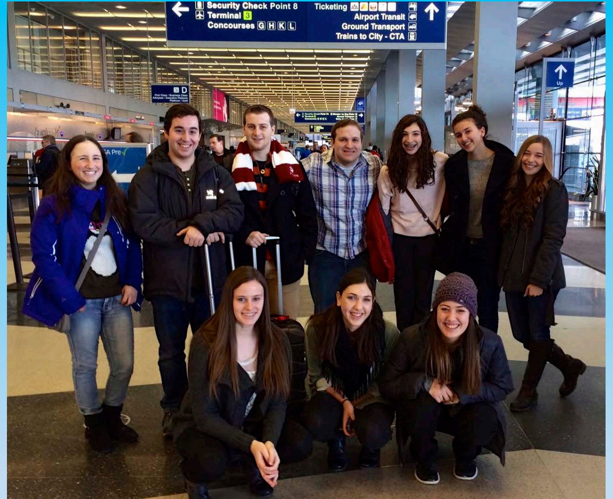
BJBE Teens heading out to DC!