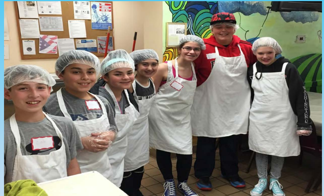
JYG volunteers at a Just Harvest!