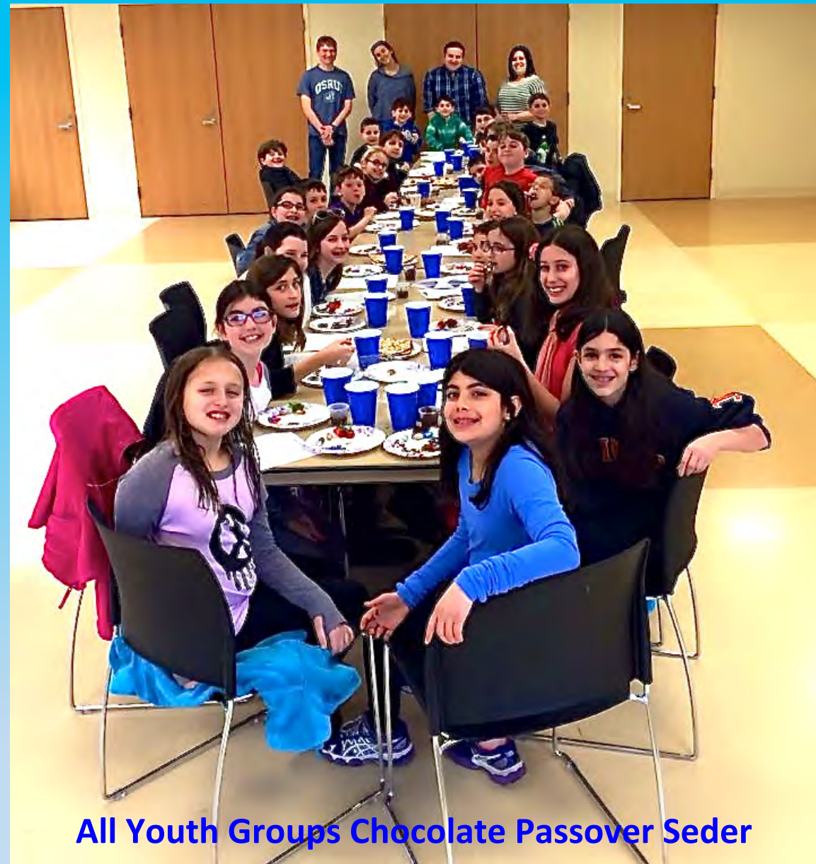
All Youth Groups Chocolate Passover Seder