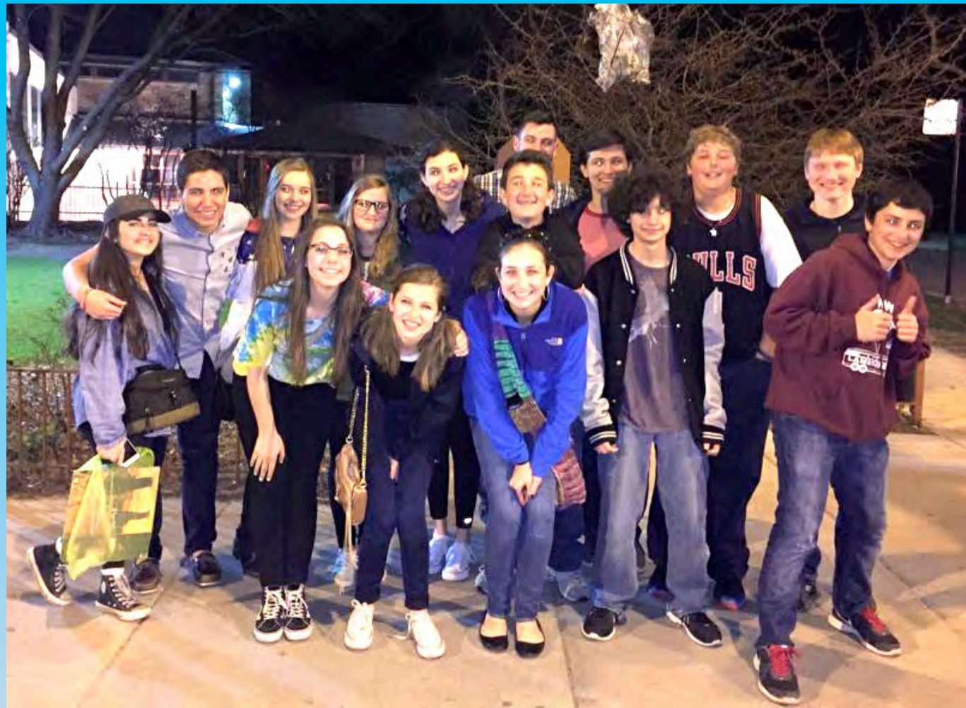
Hanging in the city with our friends at Anshe Emet

"{My son} is full of spirit (religious and woowoo) he loves his community here at BJBE and has loved being involved in youth group. He has a group of friends here, he enjoys being part of something bigger than himself and helping out, not to mention all the fun! His favorite activities have been going to the Bulls games and shul-ins. Youth group has led him to NFTY which he also enjoys, especially at OSRUI retreats!"