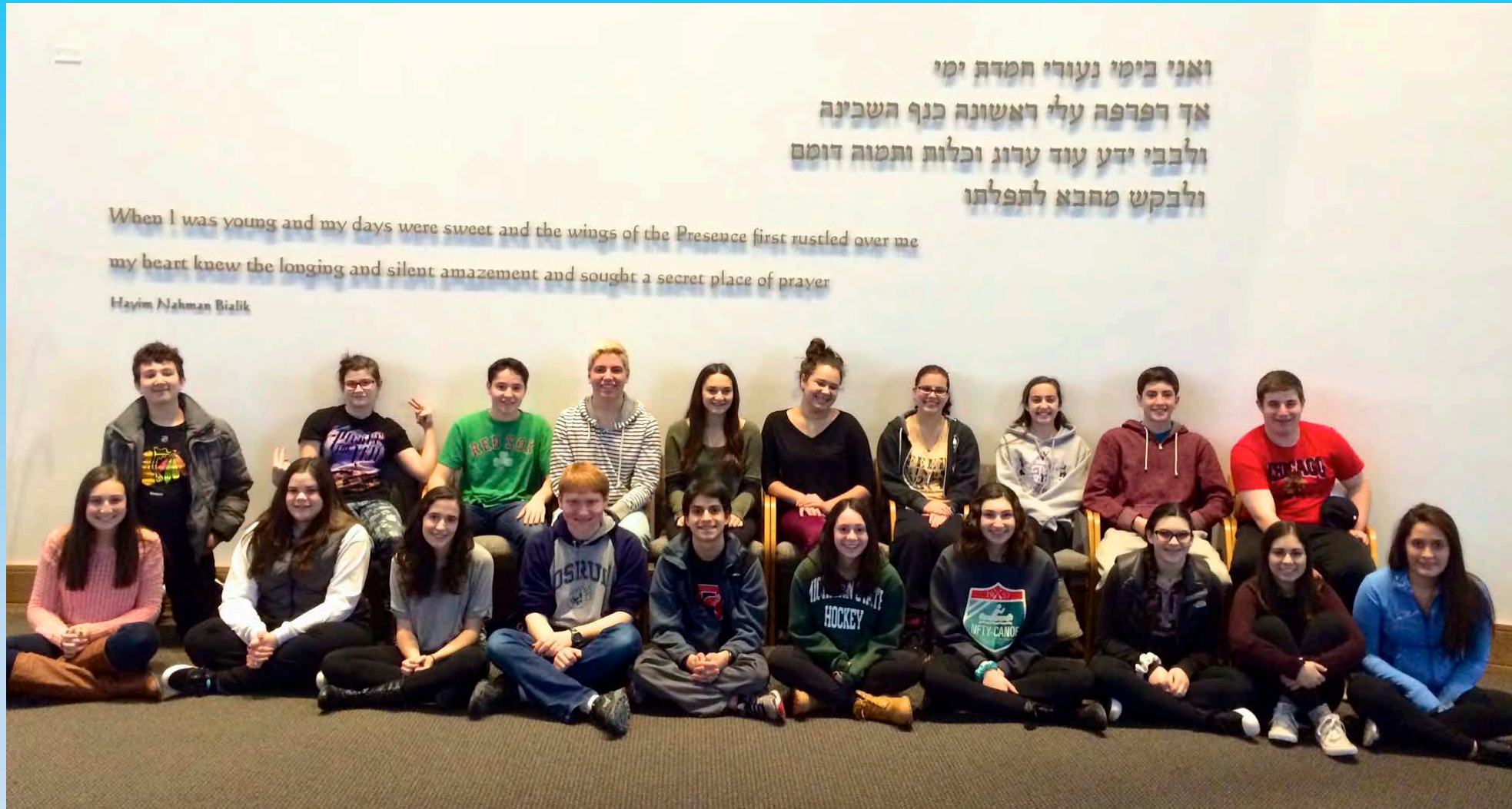
2/3 of the Kolin/Israel Teen Trip participants of June, 2015