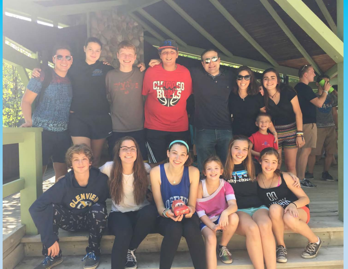
BJBE at NFTY Summer Kallah 2015