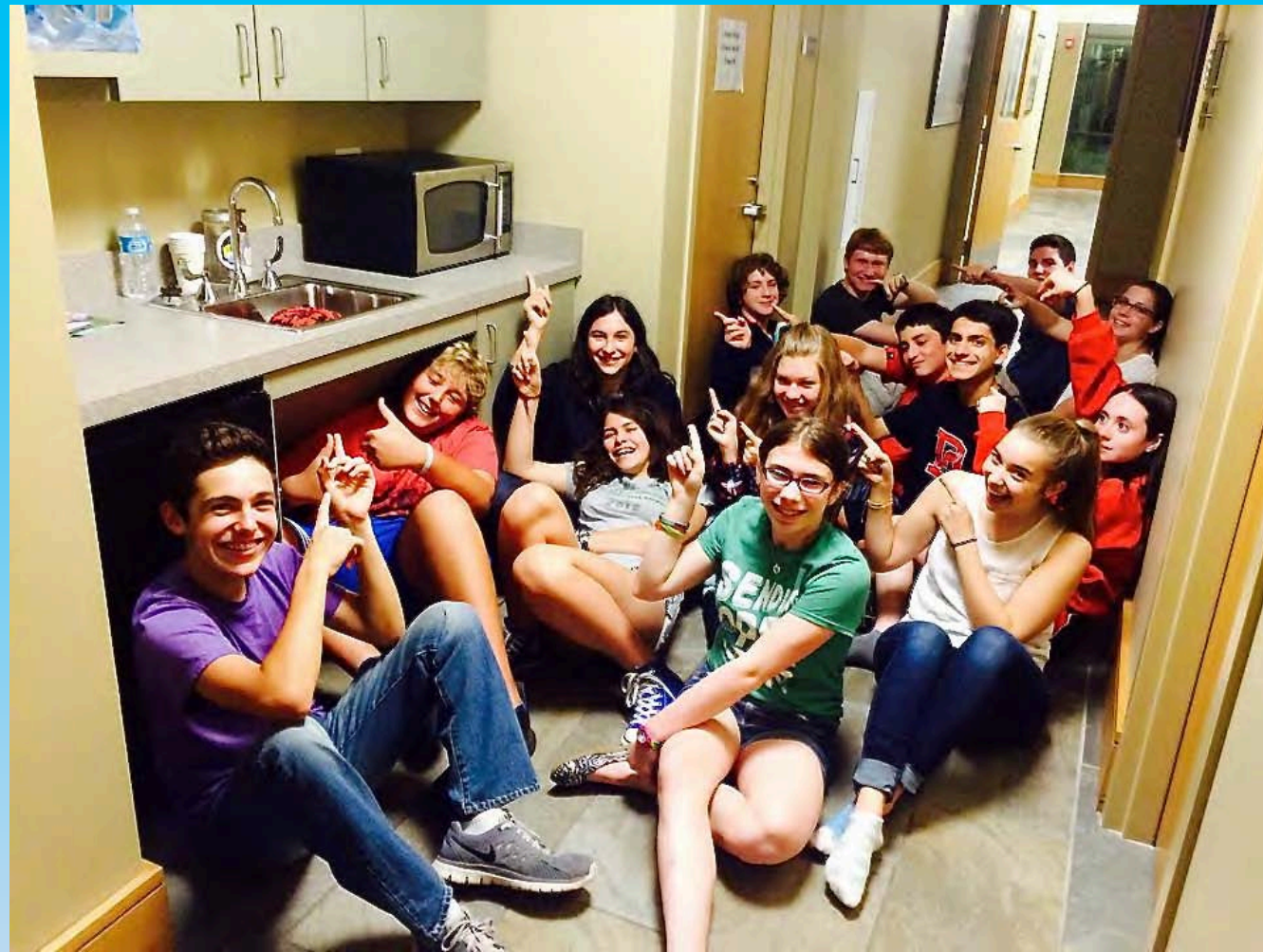
First free dinner/monthly lounge night of the year!

"{My son} is full of spirit (religious and woowoo) he loves his community here at BJBE and has loved being involved in youth group. He has a group of friends here, he enjoys being part of something bigger than himself and helping out, not to mention all the fun! His favorite activities have been going to the Bulls games and shul-ins. Youth group has led him to NFTY which he also enjoys, especially at OSRUI retreats!"